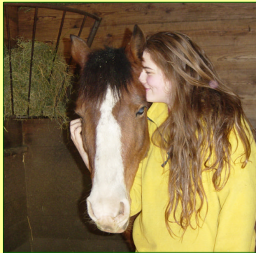
Donated horses are cared for by professional staff and motivated volunteers

All horses are adopted out to beneficial causes and loving homes upon retirement.